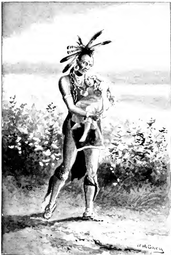
BLACK PARTRIDGE AND THE SUN MAID.